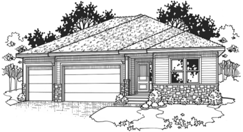
Elevation A with stone upgrade