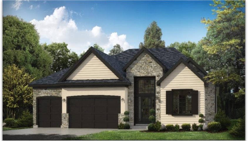
Optional Elevation Upgrade Shown Above

*Base price may fluctuate depending on city & neighborhood requirements